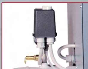
PRESSURE SWITCH Pressure switch with thermal circuit-breaker.