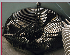
FAN It guarantees optimum cooling including in heavy operating conditions.